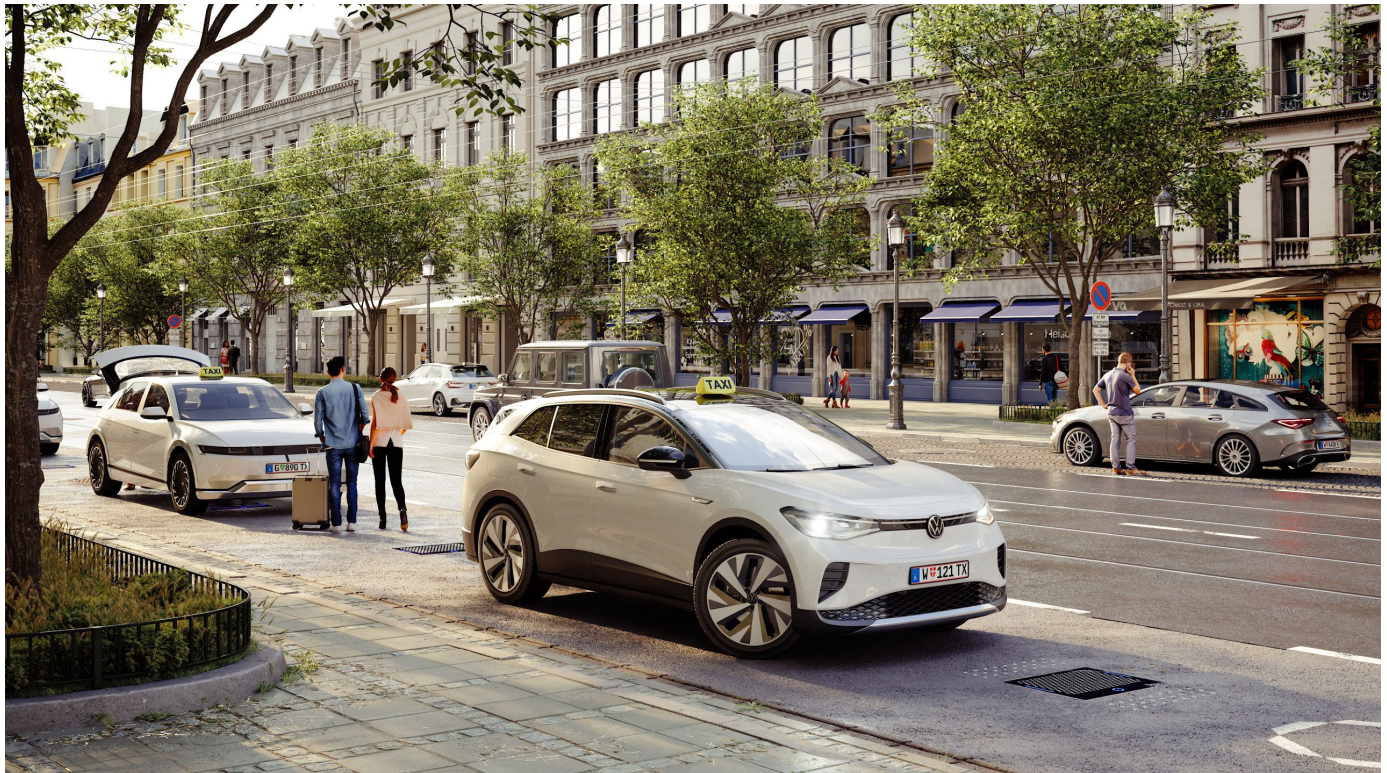
eTaxi Austria project: automated charging networks with Matrix Charging® for eTaxis in Vienna and Graz